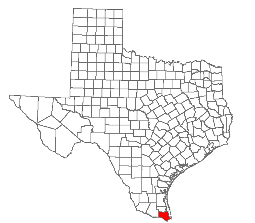
Cameron County, Texas

*TRAFFIC AND FLOOD-RELATED ROAD TRIPS FOR THE UNINCORPORATED AREAS OF CAMERON COUNTY -Abbreviations of culvert material: CMP = Compulsory Metal Pipe; HDPPE = High Density Polyethylene; RCBC = Reinforced Concrete Block Culvert; RCP = Reinforced Concrete Pipe.